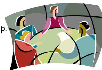
Table 2 What to expect at team meetings...

There will usually be three team-meetings to attend before the camp. All leaders are expected to attend all the meetings. (See table 2 below for an ideas of what to expect at the meetings.)